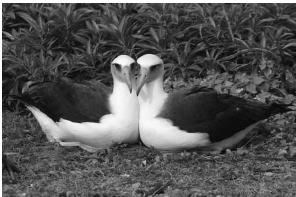
Figure 1. A female-female Laysan albatross pair at Kaena Point.

incubation duties. All females in these pairs were unrelated ( p > 0.05 for all pairwise comparisons). Female-female pairs were also present in Laysan albatross on Kauai ( N = 18 ).