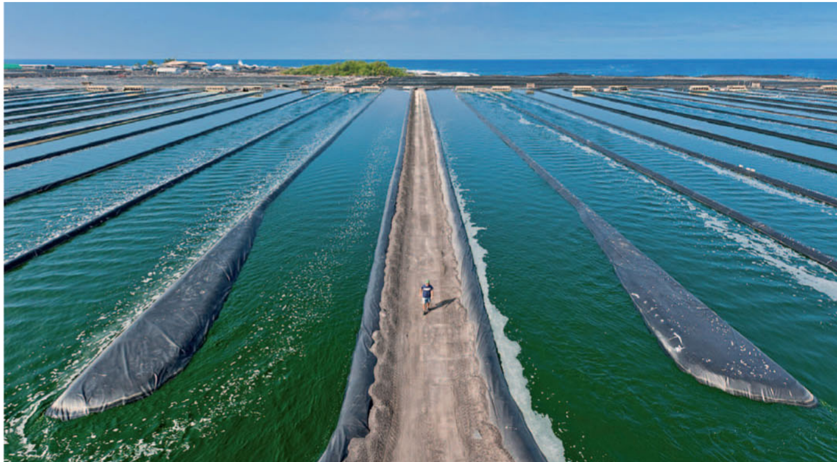
Algae farms require vast water surface areas to efficiently convert sunlight into an oil used as a biofuel.